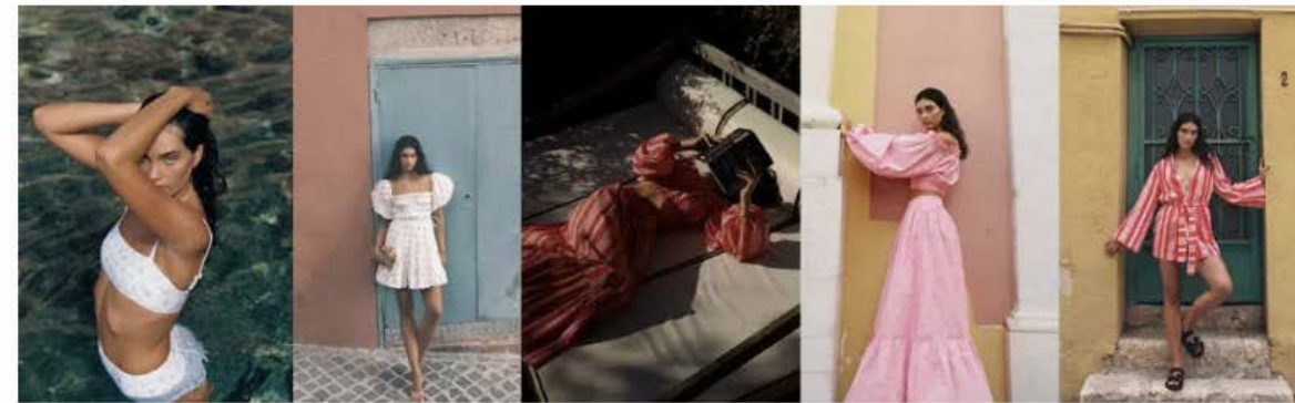
Summer Essentials For Your Vacation Packing List PALM.NOOSA

Summer 2023 is hotting up, and that European getaway is finally on the cards after three years of on-again, off-again travel restrictions. With these summer essentials for your packing list, the vacation of your dreams will look extra stylish.