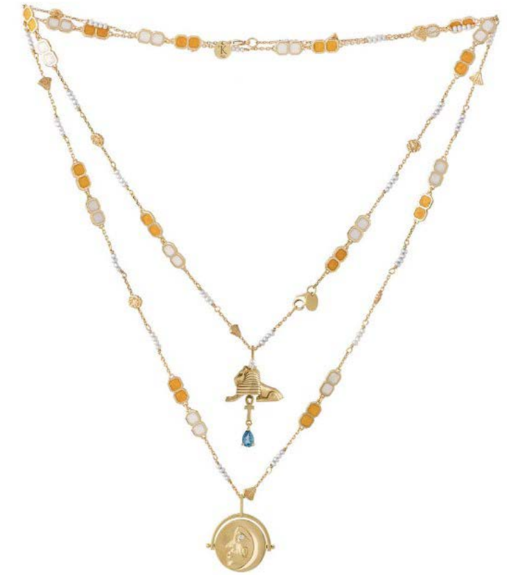
KATARINA TARAZI Hex Chain Sautoir

Of course, not every piece has to be saved for best. Everyday jewellery can be equally as pulse-quickenning, and switching it up is the easiest way to update your look in an instant and make it feel more current.